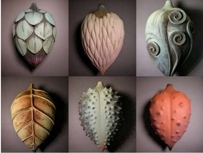
Alice Ballard – Pods