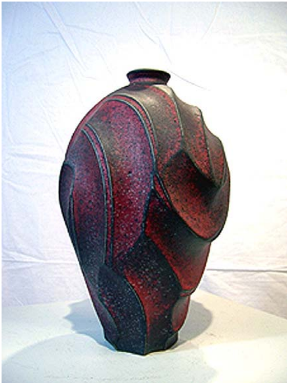
Jim Connell – Sandblasted Carved Bottle